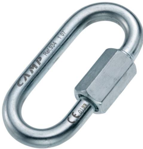
Oval Quick Link Steel 0934 Ø 8 mm

Manufactured from zinc plated carbon steel.