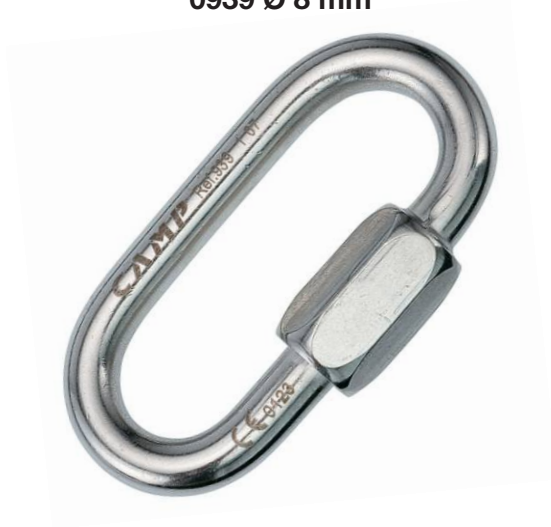
Oval Quick Link Stainless 0939 Ø 8 mm

Manufactured from stainless steel for outdoor installations or corrosive environments.