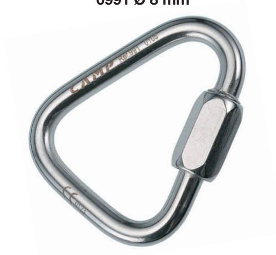
Delta Quick Link Stainless 0991 Ø 8 mm

Manufactured from stainless steel for outdoor installations or corrosive environments.