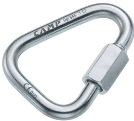
Delta Quick Link Steel 0955 Ø 8 mm

Manufactured from zinc plated carbon steel.